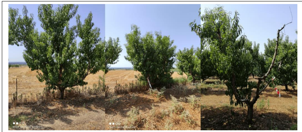
Fig. 2. RGB images

These modalities represent the peach tree cultivation in many levels. Each modality describes the same object (peach tree) within the dataset, i.e., for each tree within. For example, Fig. 2 shows RGB images, Fig. 3 illustrates multispectral images, and Fig. 4 provides UAV images. All images show the same peach trees under three (RGB, multispectral, and UAV) aspects.