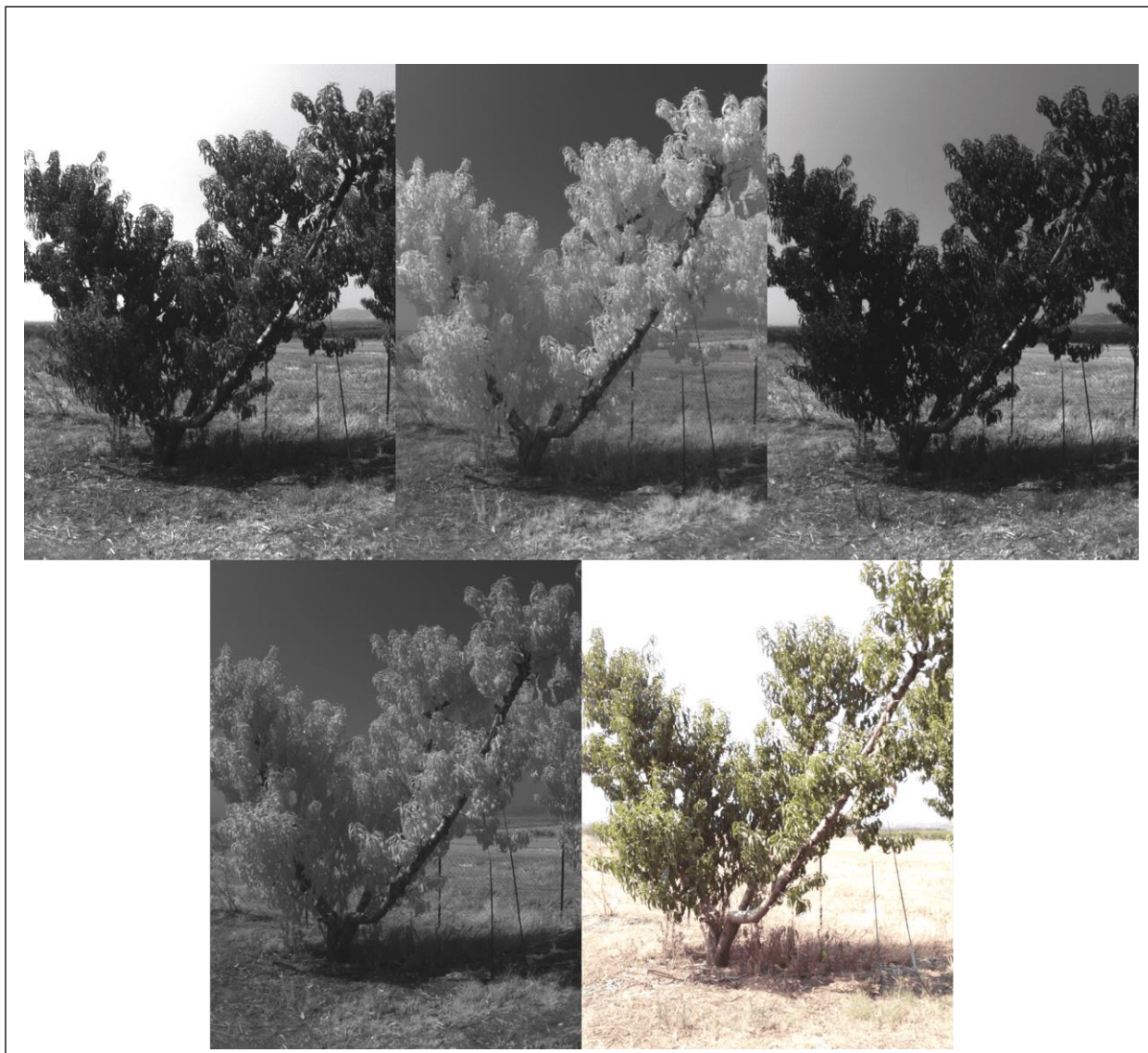
Fig. 3. Multispectral images